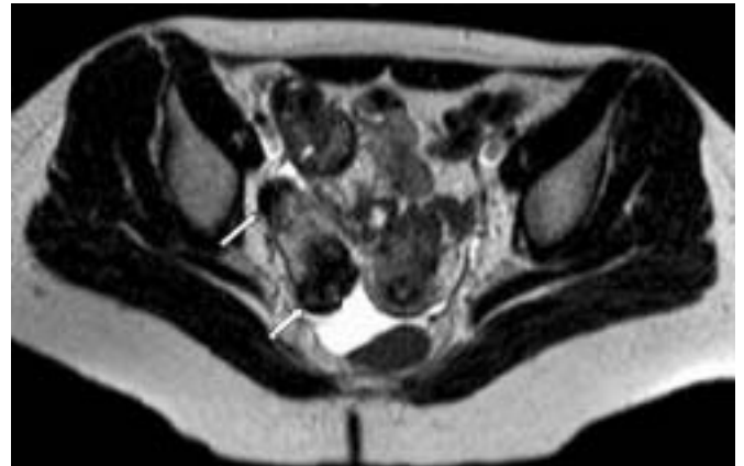
Figure 1: Axial T2-weighted MR image shows two ovarian well defined lesions (arrows; anterior 18x18 mm, posterior 34x25 mm) with very low signal intensity, a finding that is suggestive of an ovarian fibroma

and microscopic examination of the mass had no finding of inflammation or abscess, microscopic examination showed an ovarian fibroma, (Figure 2). She is now in the sixth postoperative month and still has no fever.